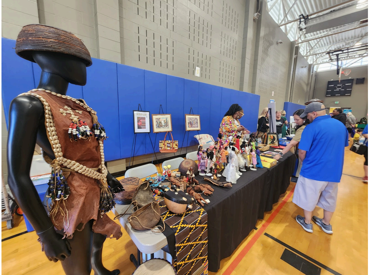
Attendees visit a vendor table.