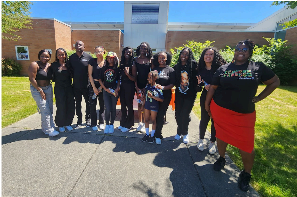
Members of Project Girl pose for a photo during Juneteenth.

Juneteenth was sponsored by Project Girl, a mentoring program designed to foster the advancement of young women of color. Learn more about Project Girl here .