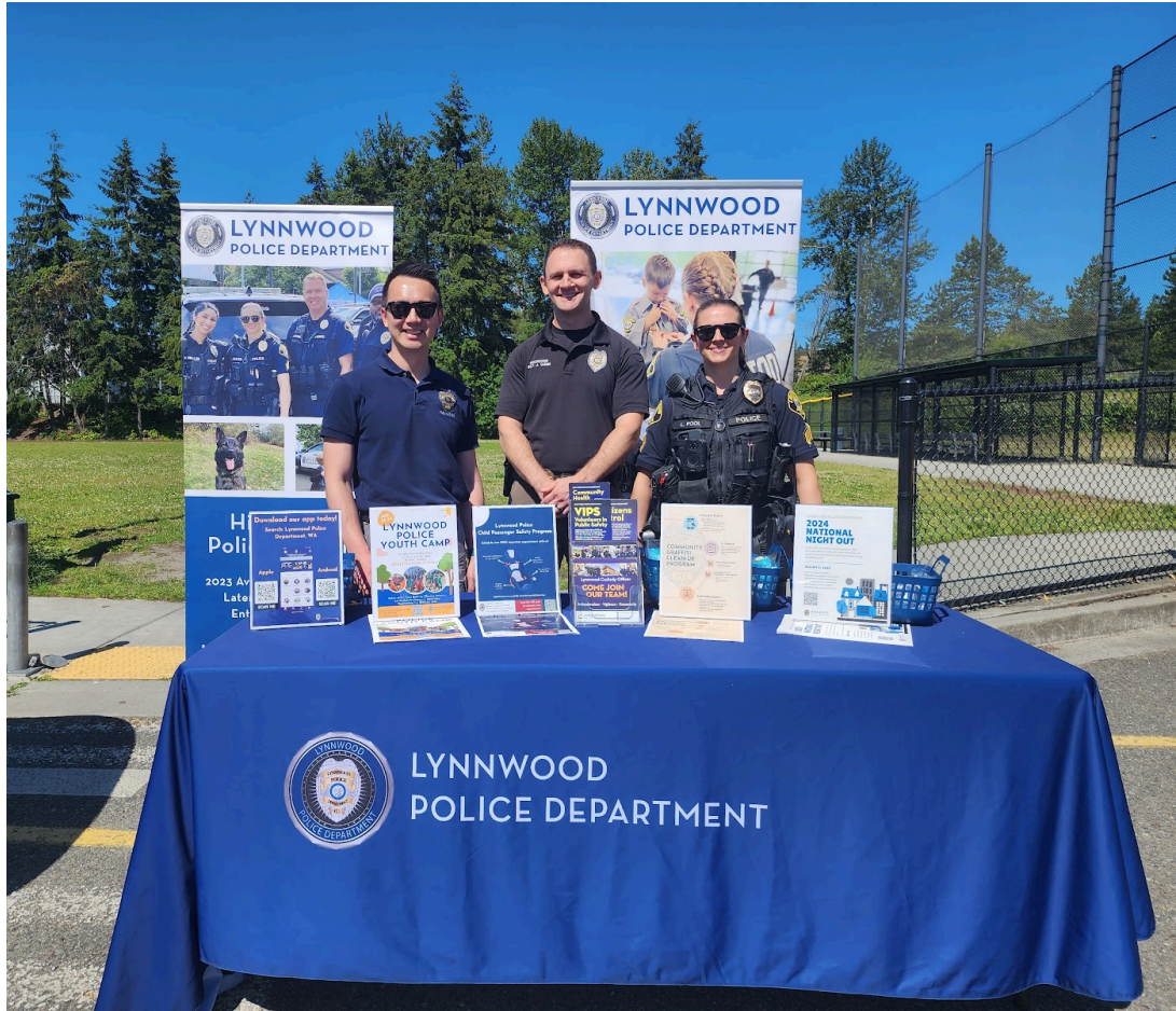
Members of the Lynnwood Police Department celebrate Juneteenth at Cedar Valley Community School.