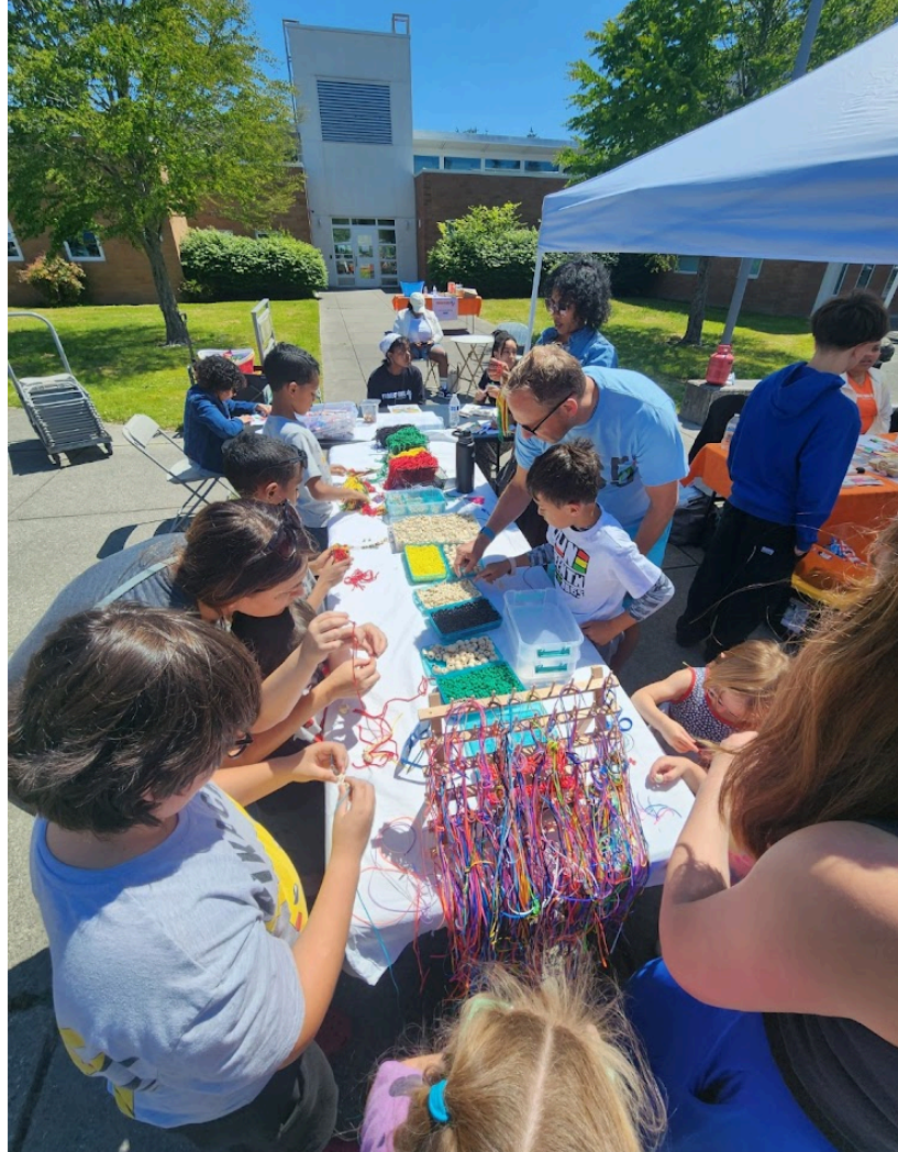
Kids celebrate Juneteenth with arts and crafts.