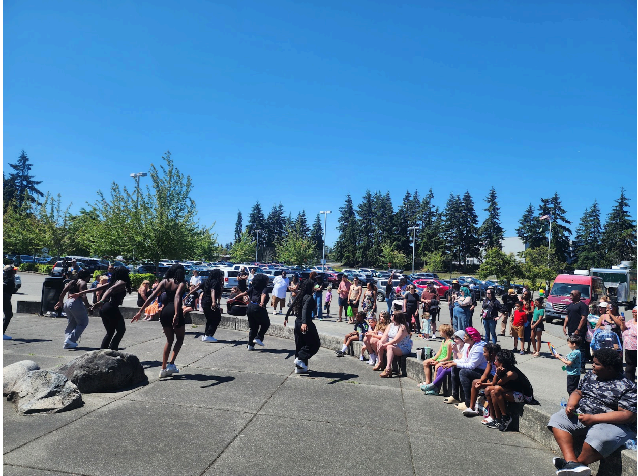
Project Girls performing in front of community members on Juneteenth.

Families had the opportunity to interact with some of the vendors.