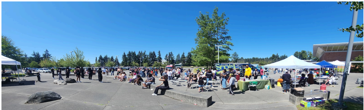
Project Girl's dance performance for the community of Lynnwood

Also known as Emancipation Day or Freedom Day, Juneteenth marks the day in 1865 when Union soldiers arrived in Galveston, Texas to tell the last enslaved African Americans in the Confederate South that they were free and no longer under bondage.