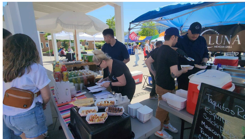
Luna Mexican Grill with delicious menu options

One of the food vendors was Luna Mexican Grill.