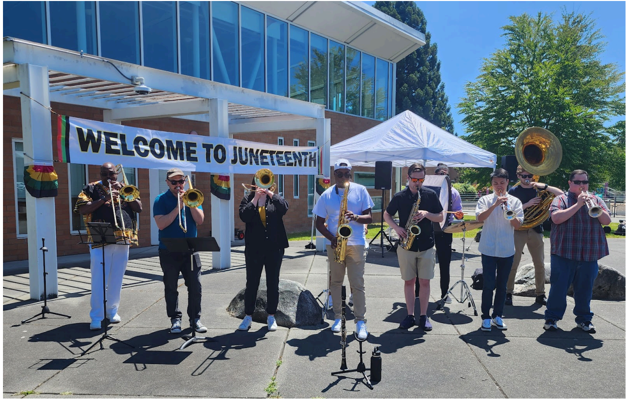
A live band performance at Cedar Valley Community School during Juneteenth.