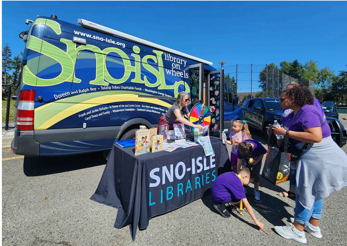
Sno-Isle Libraries Pop Up Van