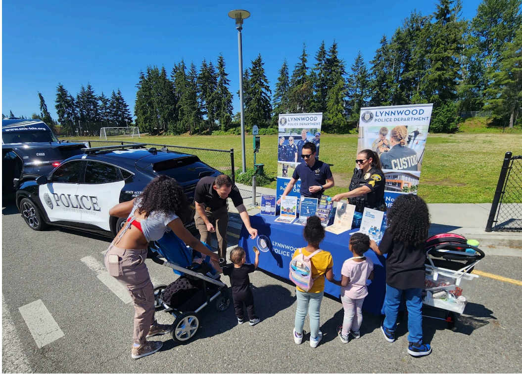
Lynnwood Police Department members interact with the community.