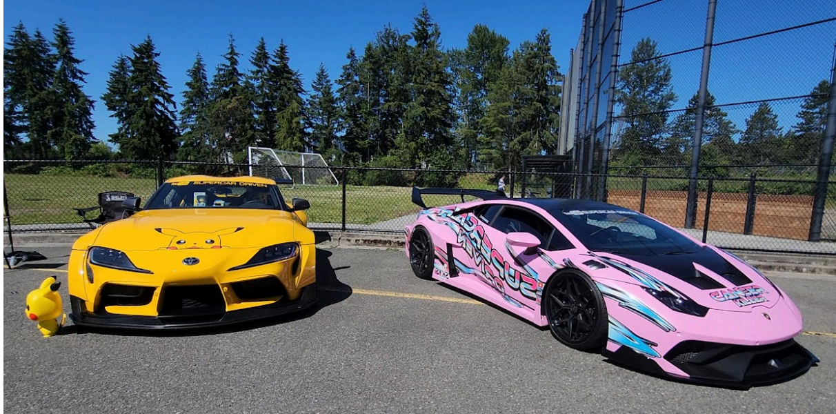
Supercar Driven supporting the community with a custom Lamborghini & Custom Pickachu Themed Toyota Supra