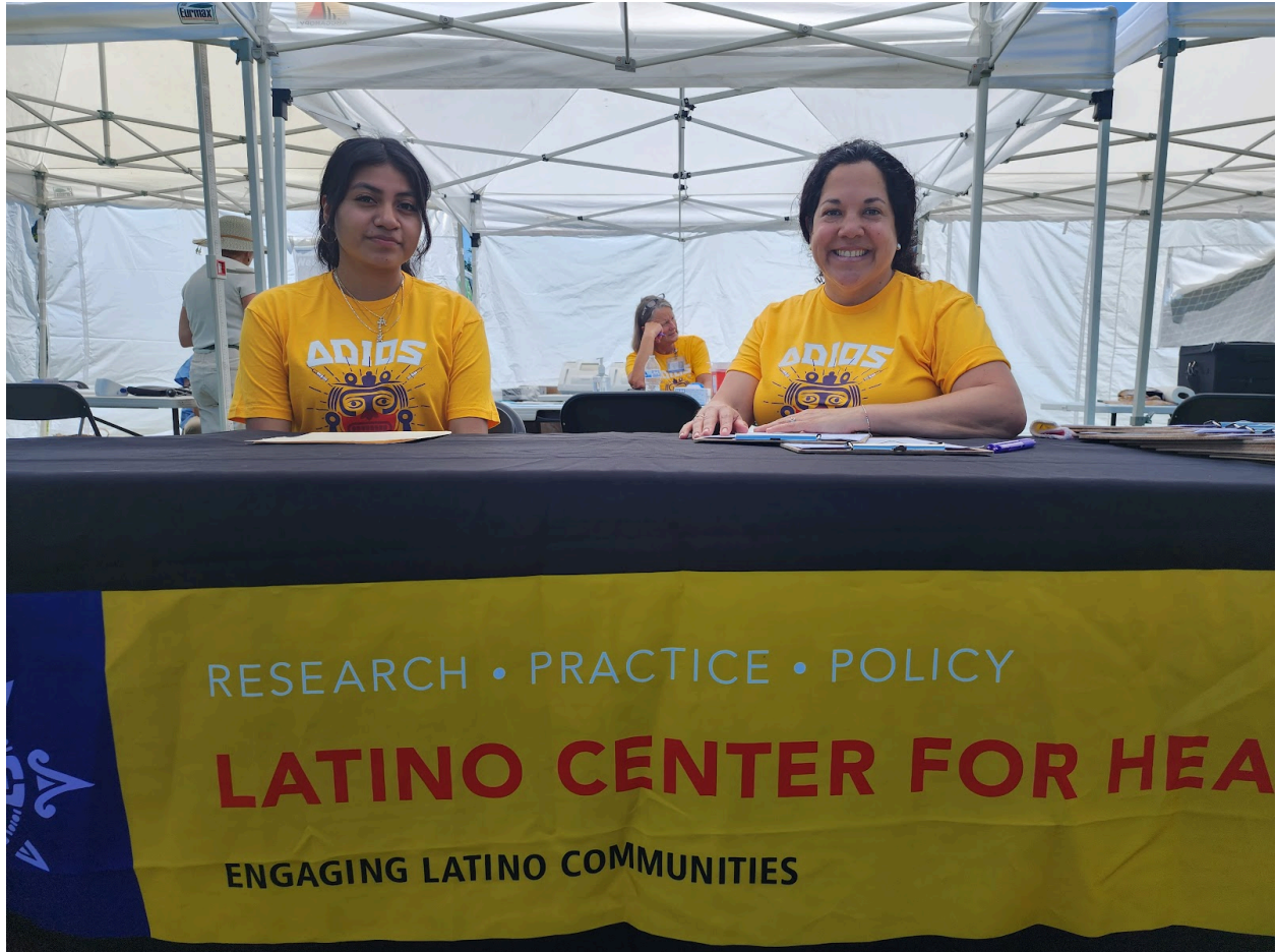
Latino center for health - focused on engaging Latino communities