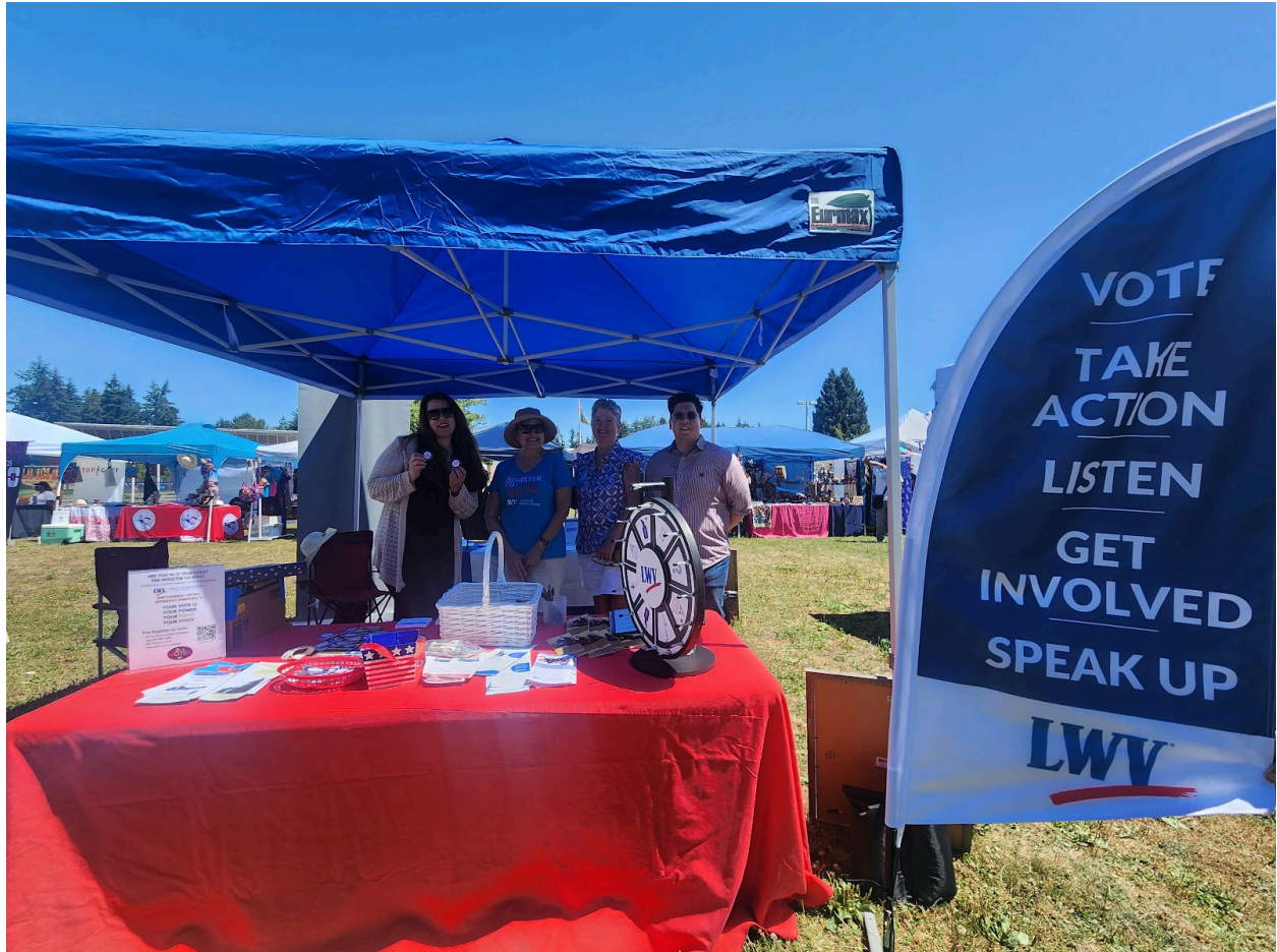
Sharing with Community members voting information.