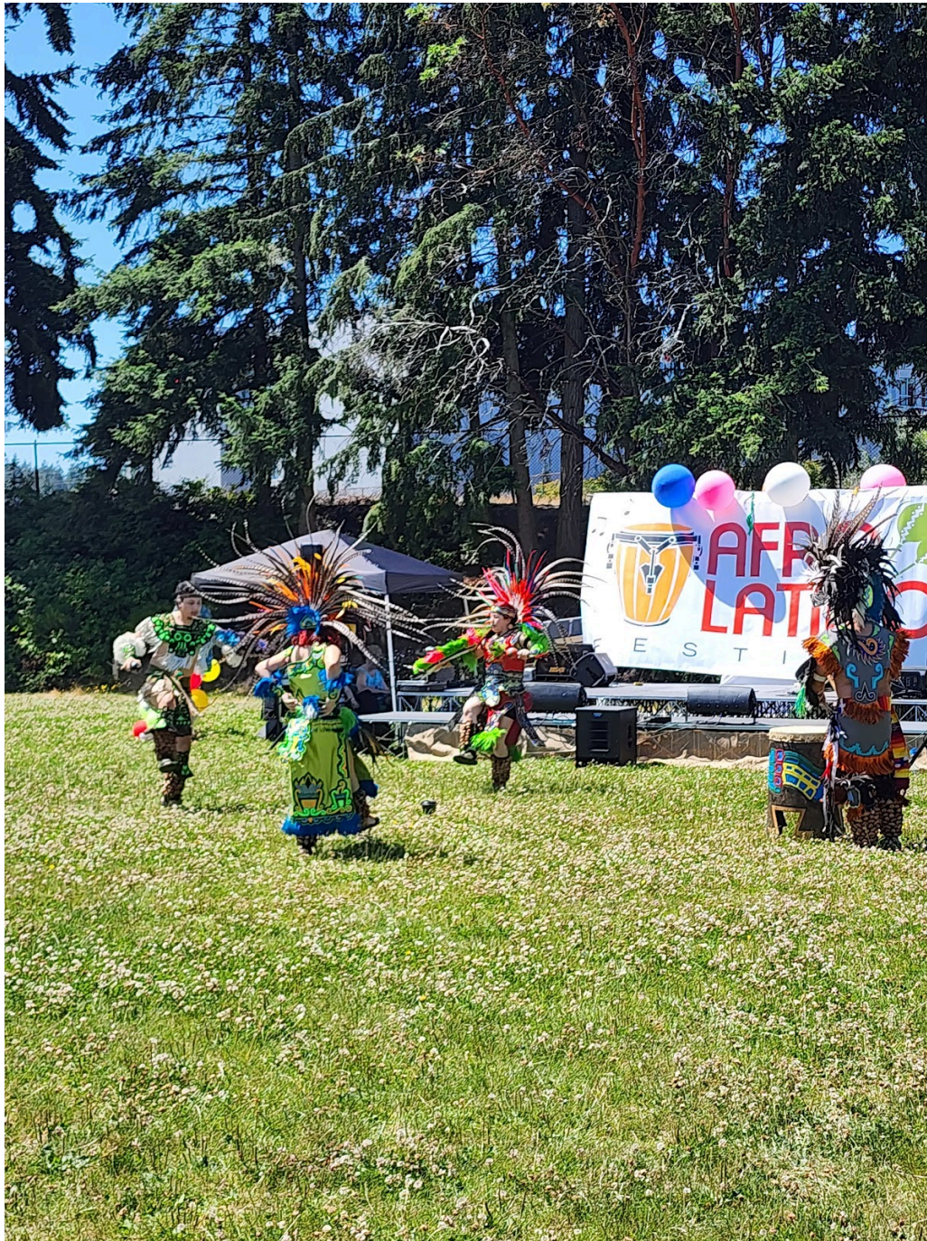
Sharing culture dances with the community of Lynnwood.

The 2024 Afro Latino Festival was celebrated at the Cedar Community School on Saturday, 13th, 2024. The event included hundreds of community members, nonprofits, and businesses that serve our communities.