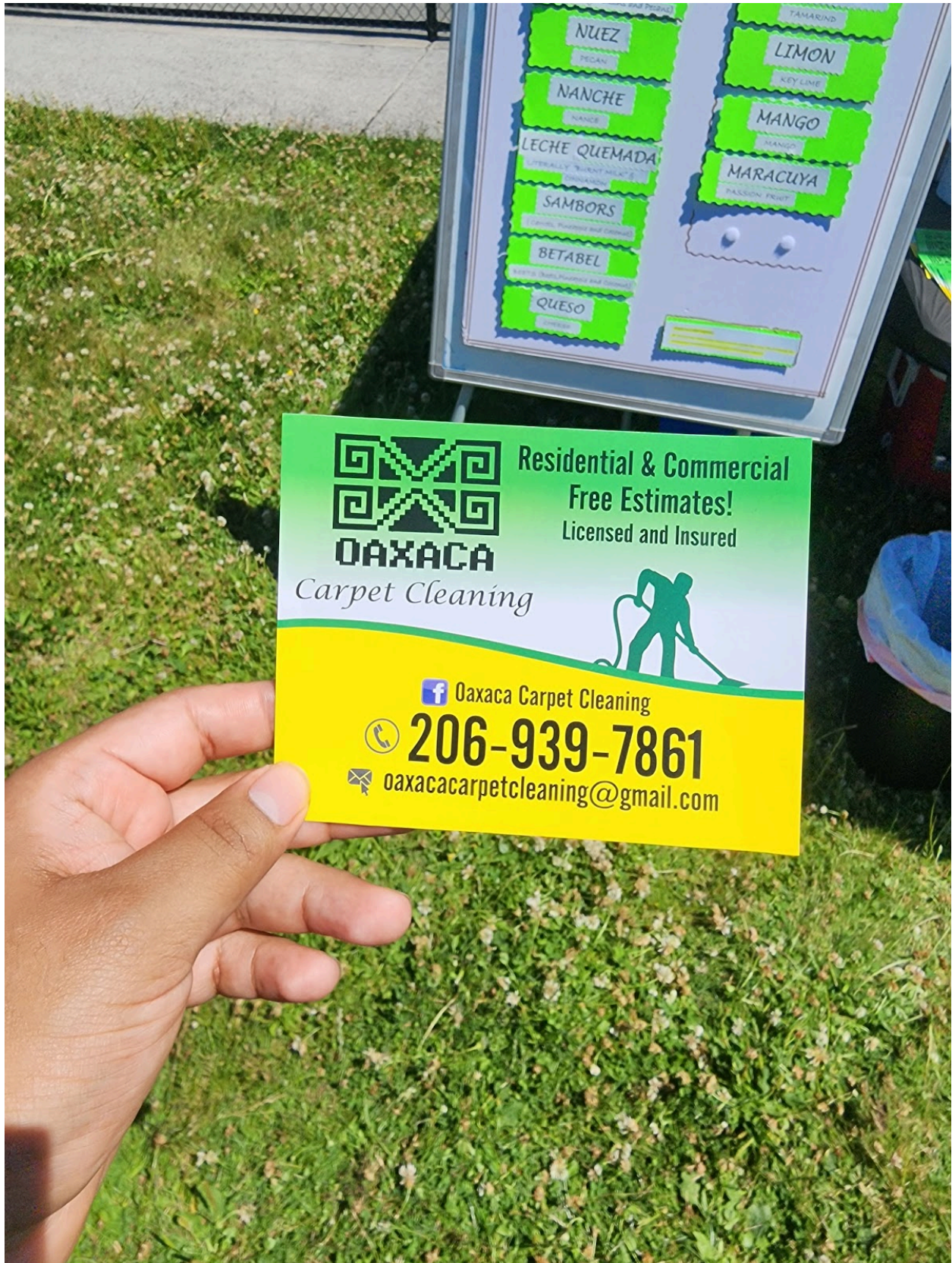
Aguas frescas & ice cream by Oaxaca Carpet Cleaning