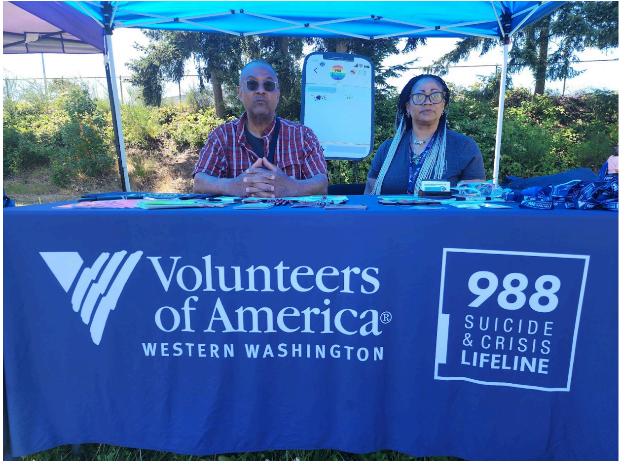
Volunteers of America - 24/7 Assistance