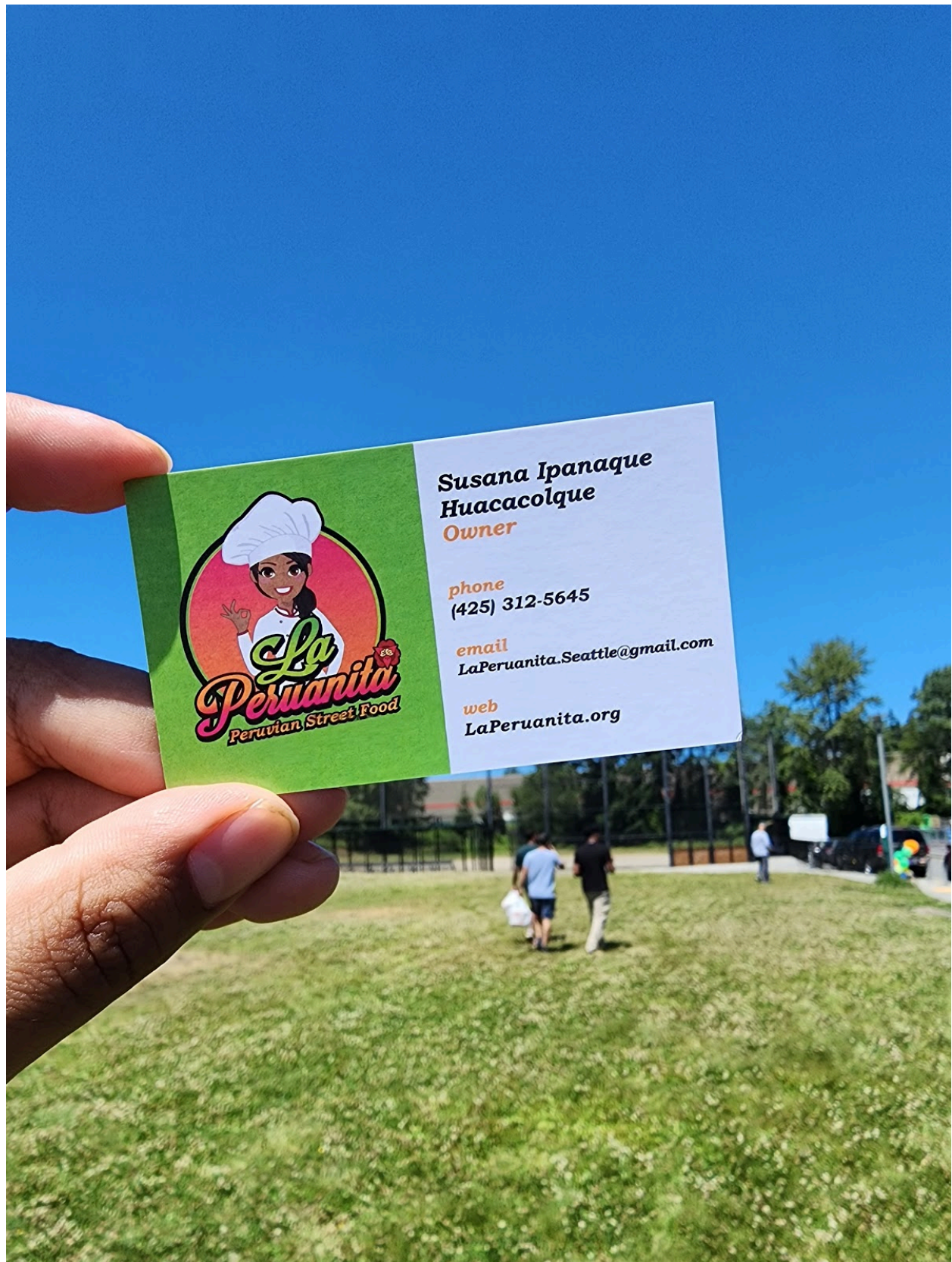
Peruvian street food by La Peruanita