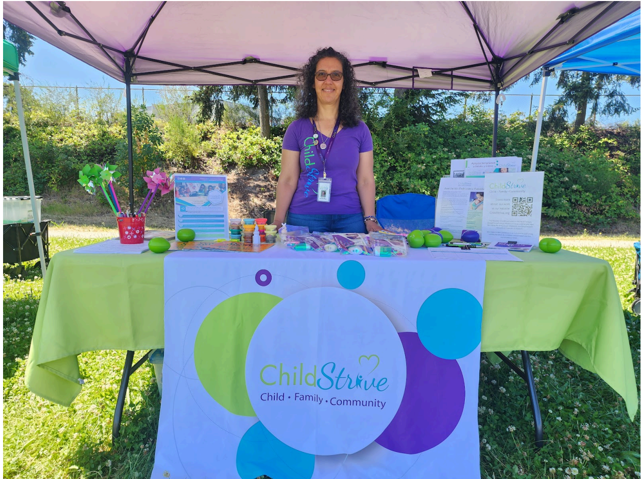
Child Strive focused on children, and families in our community.