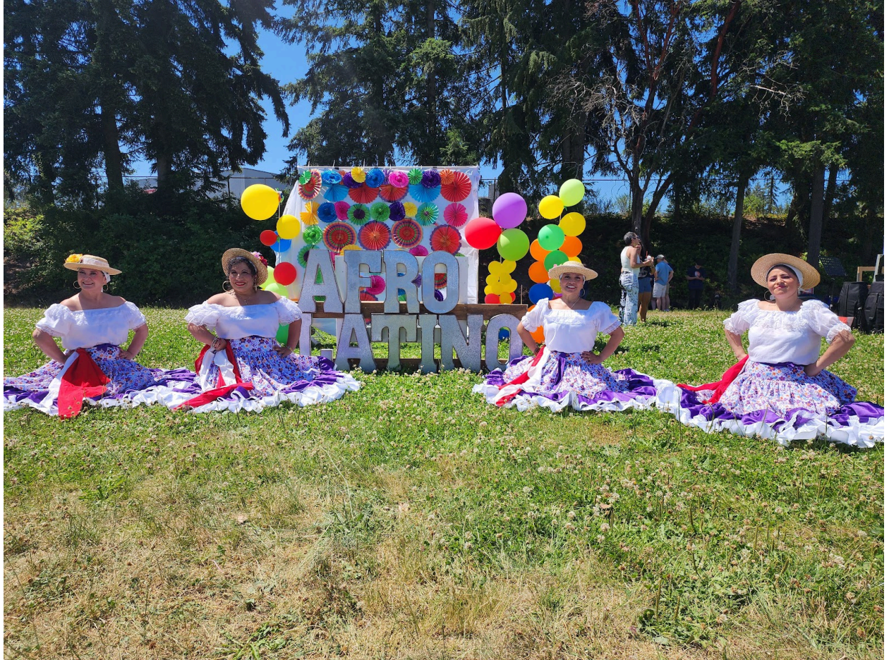
AFRO LATINO CELEBRATING OUR CULTURE.