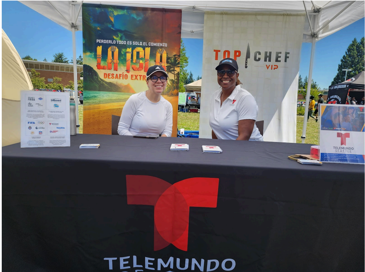
Telemundo shared information on their most recent projects: LA Isla Desafío Extremo & Top Chef VIP