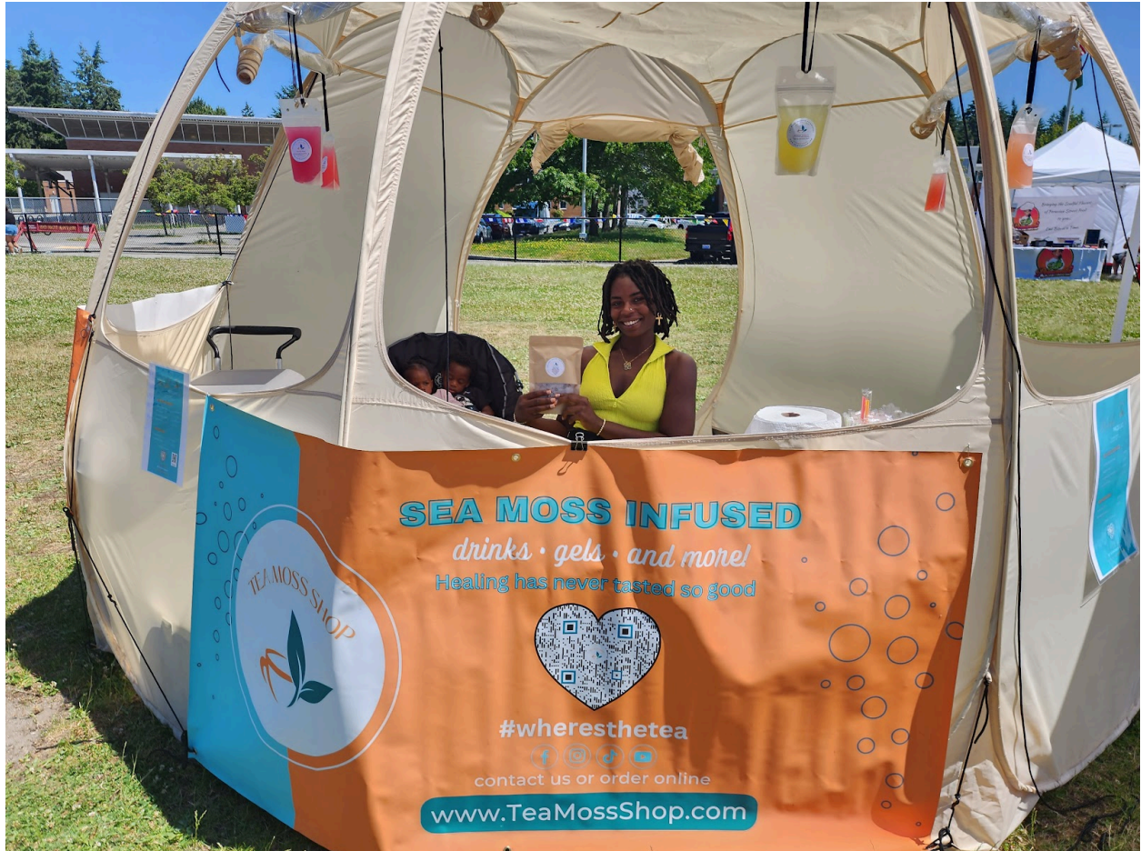
Tea Moss Shop with Sea Moss Infused drinks, gels, and more.