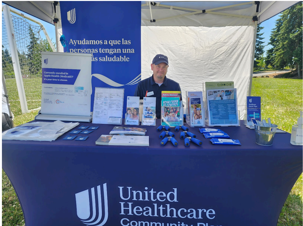
United health care community plan helping our community live a healthier life.