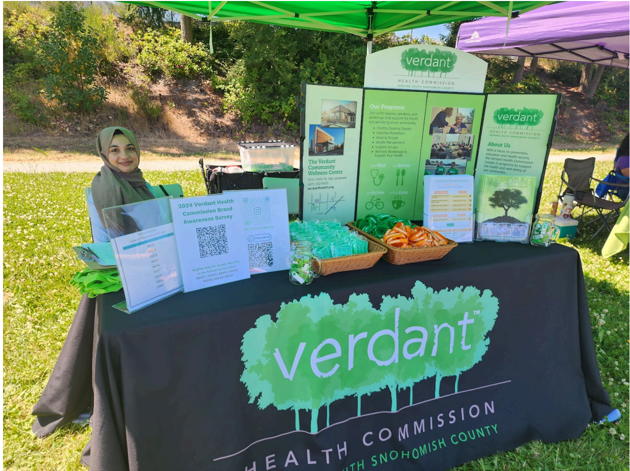
Verdant Health Care supporting our local community with health resources