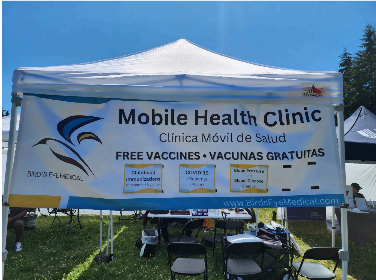
Birds Eye Medical hosted a mobile health clinic and offered free vaccines.