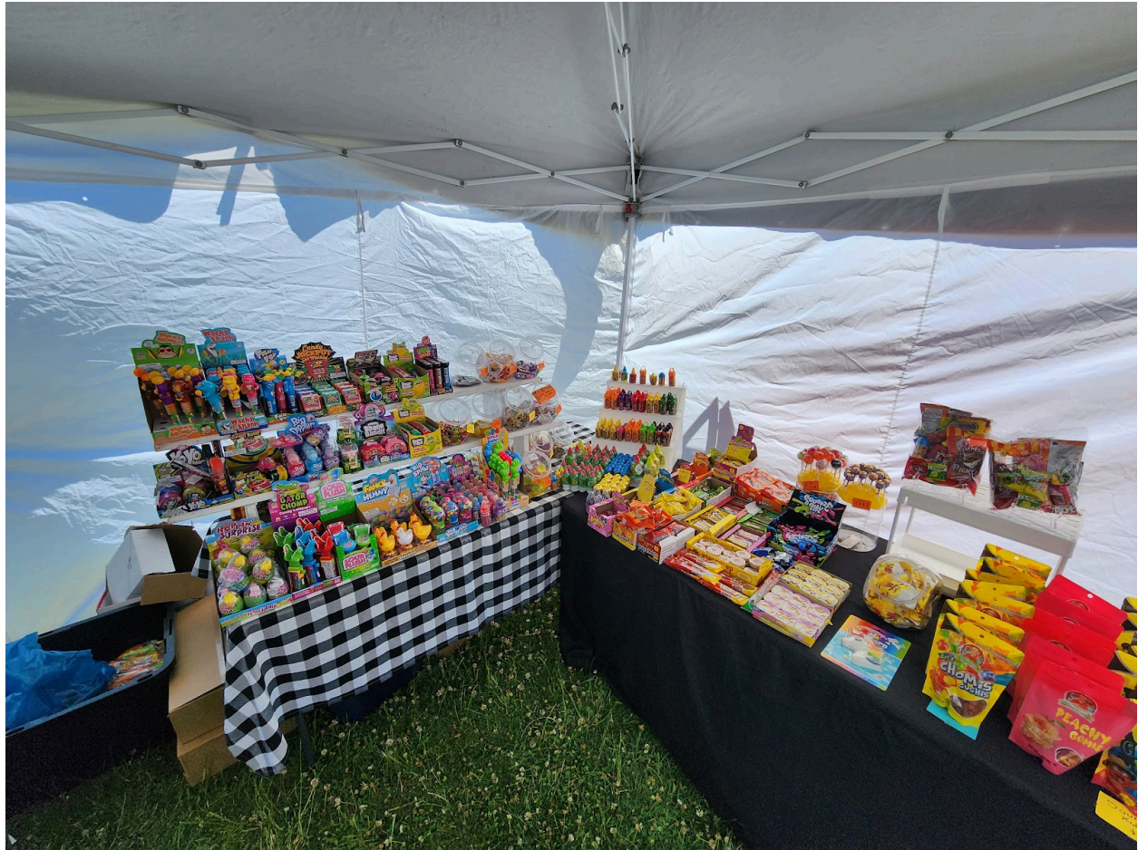
Candy plushies, piñatas and gifts.