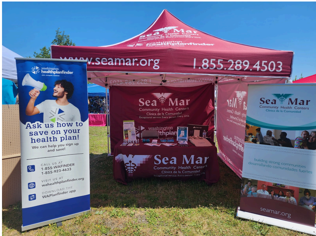
Sea Mar Community Health Centers